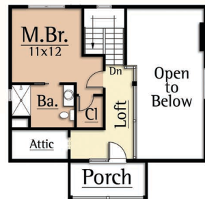
Upper Level 440 square feet