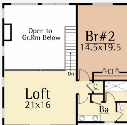
Upper Level 897 square feet

On the Upper level, the Zerenity includes a guest bedroom and a large loft that can double as an additional sleeping area.