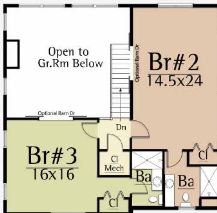
Upper Level 897 square feet

On the Upper level, the Zerenity II includes two guest bedroom suites with optional barn doors to view down to the great room below.