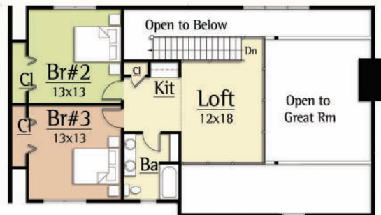
Upper Level 787 square feet