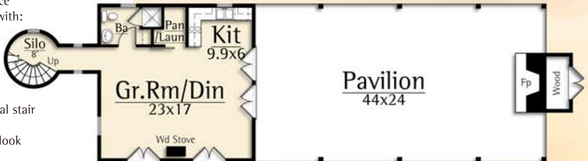
Main Level 644 square feet