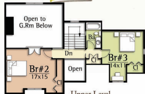
Upper Level 706 square feet