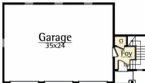
Main Level 122 square feet