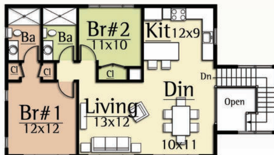
Upper Level 1,058 square feet

ELM CARRIAGE HOUSE 1,180 total square feet