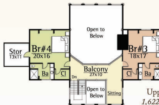
Upper Level 1,622 square feet

On the interior, the Buckeye creates spacious living with four bedrooms and grand spaces. The Great Rm soars up to a vaulted ceiling and log trusses. Two master suites on the main level complete this rugged luxury home.